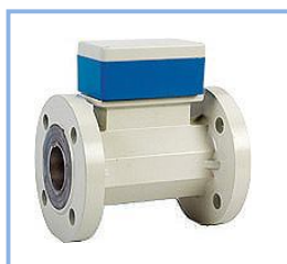
Pulse or Analog Output