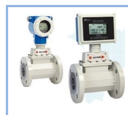
Battery Powered or Compensation